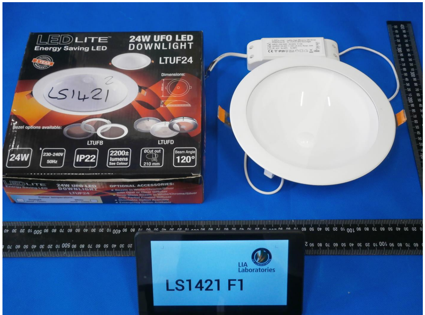
Figure 3. Product image